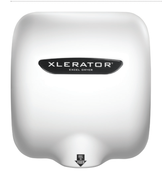
XL-BW White Thermoset Resin (BMC)