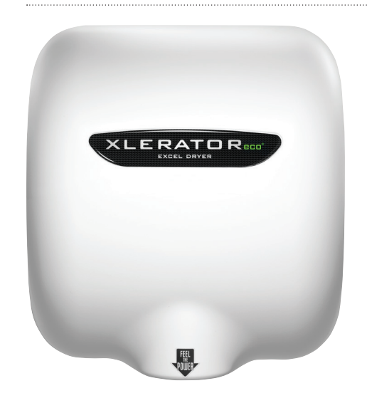
XL-BW-ECO White Thermoset Resin (BMC)