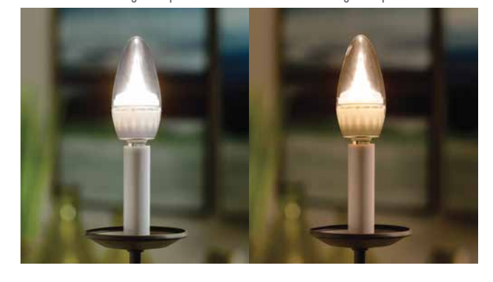
Candlelight 1800K 20% light output