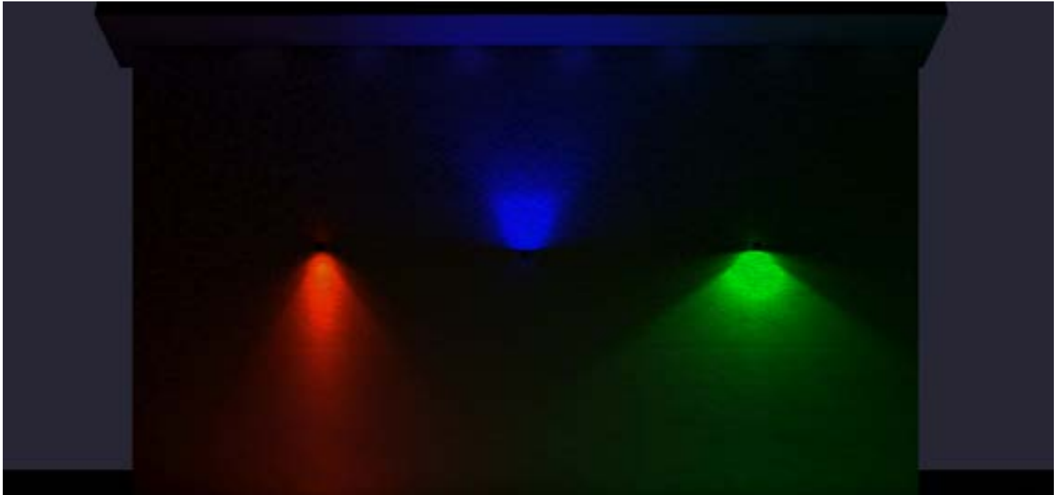
Narrow "D" Optic

For Replacement Battery Backup, see the DuraGuard LED Battery Backup Specification Sheet.