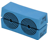
GM module with Multidiameter™