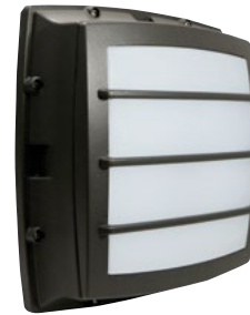
WPS25GRQ Grid Frame