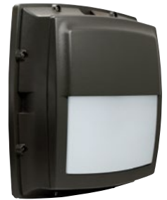
WPS25HCQ Half Cutoff