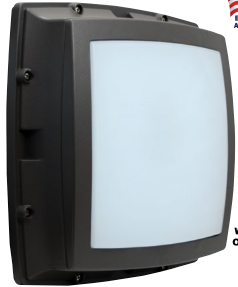
WPS250FQ Open Frame

See Page 3 for Projected Lumen Maintenance Table.