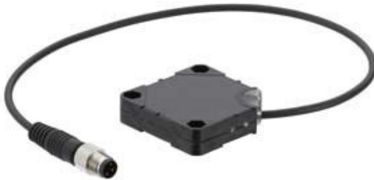
Figure can vary