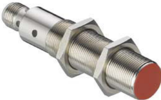
Figure can vary