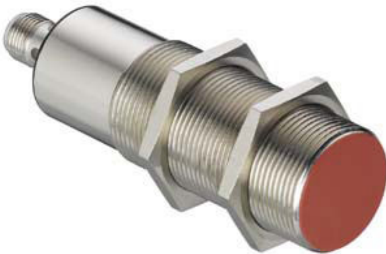
Figure can vary